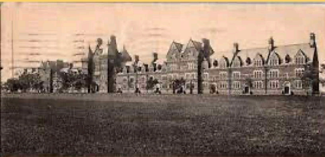
Yale's College, Hartford, Conn.